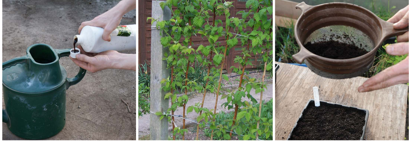
Mixing concentrated plant foods

• Always buy peat free, ideally organic compost and, of course, make and use your own compost where possible.