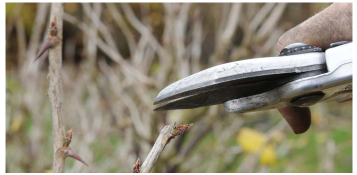
Example leading shoot and side shoot being cut back (gooseberry pictured). See instructions on next page.