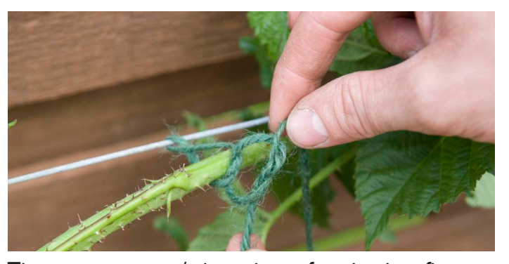
Tie stems to canes/wire using soft twine in a figure of eight. This method stops the cane/wire damaging plant stems.