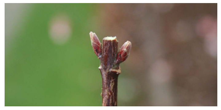
Make angled cuts when buds are positioned alternately. Make straight cuts when buds are positioned opposite.