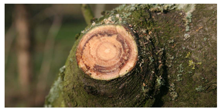
Cut stems above a branch collar, ie swollen base (pictured). This will heal quickly, unlike 'flush cuts'. Cut off larger stems in stages for safety, undercutting first to avoid bark tearing.