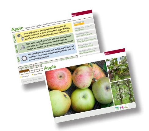
See Food Growing Instruction Cards for details of individual fruit.