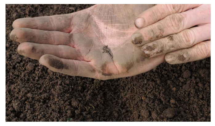
Tap small seeds off the palm of your hand. Also sprinkle seeds by taking a pinch between finger and thumb.

• Generally, cover large seeds with soil no deeper than twice their size. Outside, small seeds should be covered very lightly with fine soil. Very small seeds are best started in pots and tray (next page).