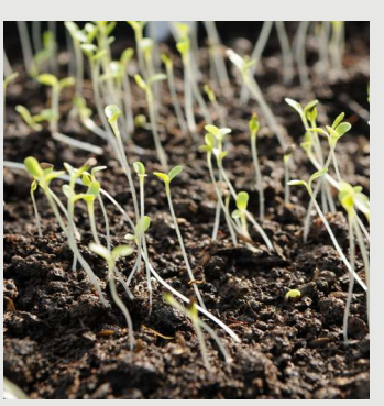
Seedlings deprived of light