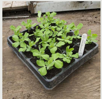
Greenhouse (Silver and Gold booklet)

Place your pot or tray in a location with enough warmth and shelter. Keep moist and in a light position for even and fast growth.